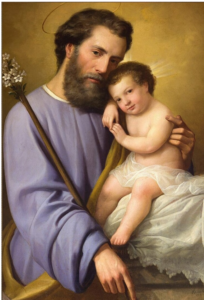
Year of St. Joseph Indulgences

The plenary indulgence is granted under the usual conditions (sacramental confession, Eucharistic communion and prayer according to the intentions of the Holy Father) to the faithful who, with a spirit detached from any sin, participate in the Year of Saint Joseph on the occasions and in the manner indicated by this Apostolic Penitentiary: