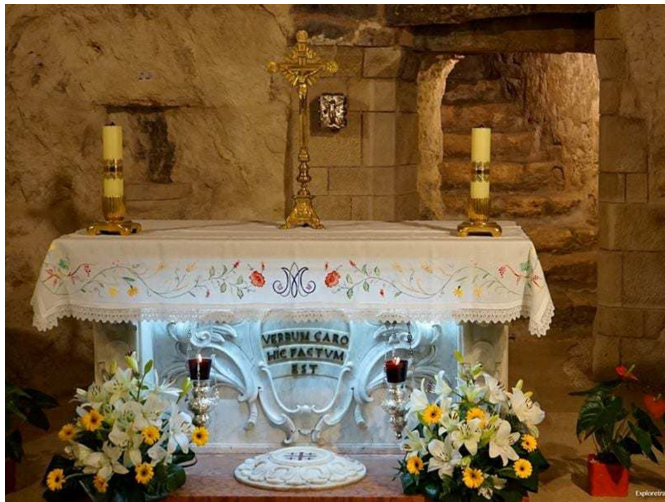
The image is of the altar at the place of the Annunciation in Israel. The Latin on the front means: “The Word is made flesh here.” That is true not only there, but at every catholic altar around the world.

So, when we come to mass to be fed and nourished, remember that the Lord wants to feed us both with his Word and Body in the mass. The Word who speaks through the readings is the same Word that becomes flesh on the altar.