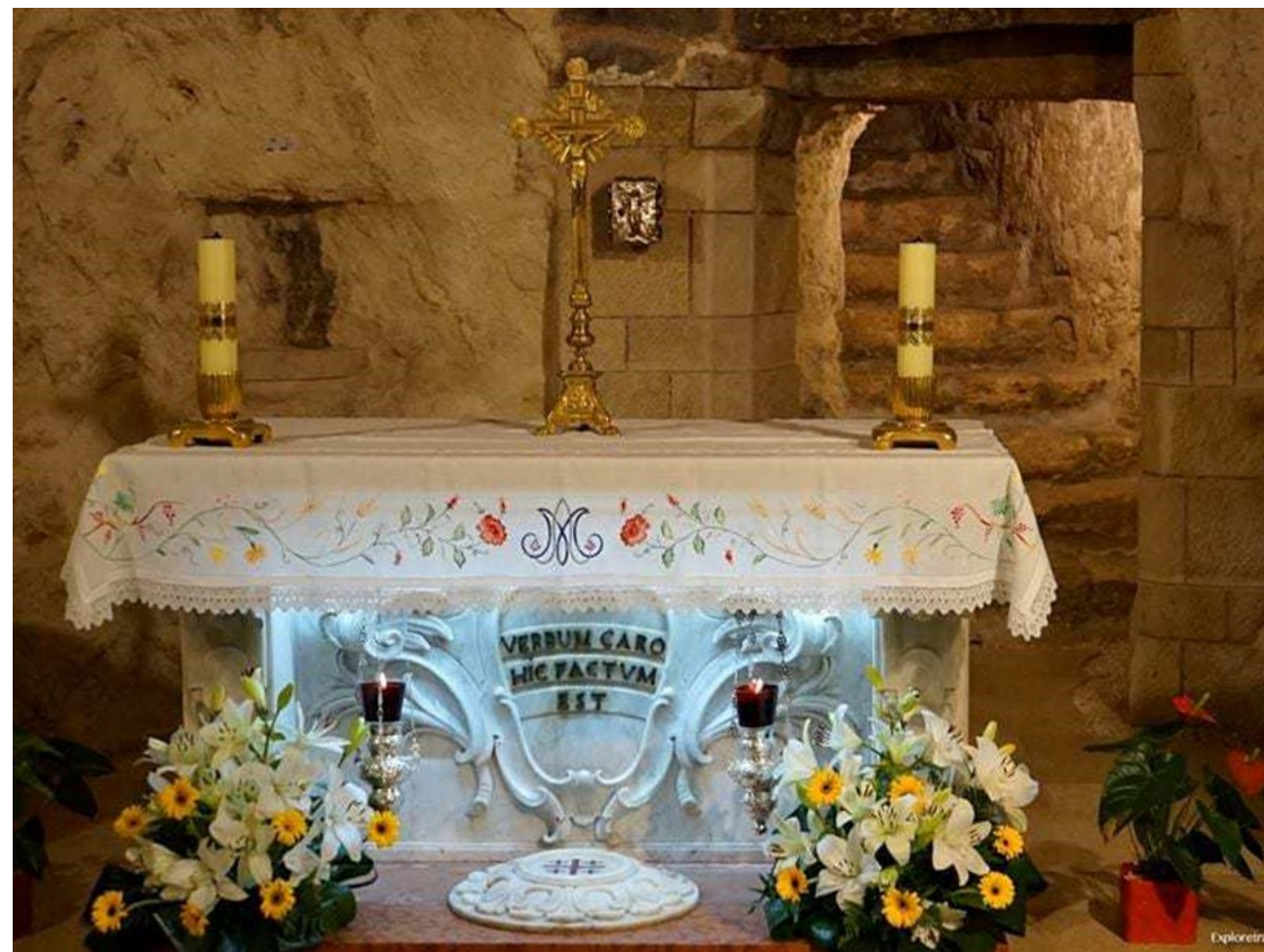
The image is of the altar at the place of the Annunciation in Israel. The Latin on the front means: "The Word is made flesh here." That is true not only there, but at every catholic altar around the world.

So, when we come to mass to be fed and nourished, remember that the Lord wants to feed us both with his Word and Body in the mass. The Word who speaks through the readings is the same Word that becomes flesh on the altar.